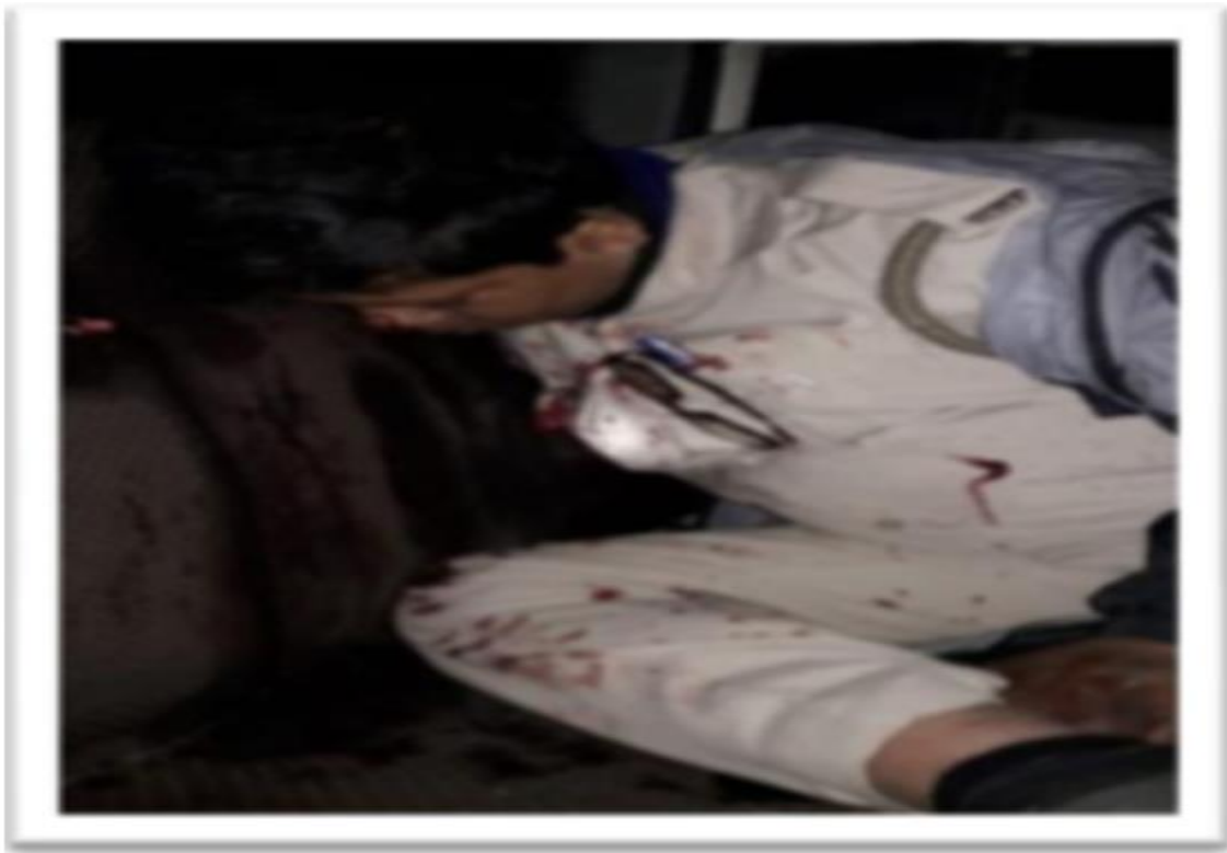
PICTURE OF VICTIM CONSTABLE